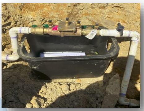
Backflow preventer on Norcum Avenue