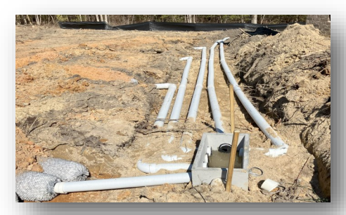
Sewer Line connection inspection at a New Single Family house on Moody Fox Lane