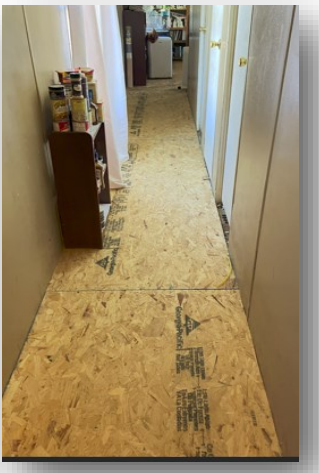
Before & after floor repair in a trailer on Wren Street after resident fell through the floor